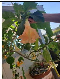
Merlin's Angel Trumpets