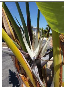
Lynn's White Bird of Paradise